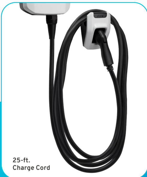
25-ft. Charge Cord

When ordering through Parts Workbench, enter part number 84922765 .